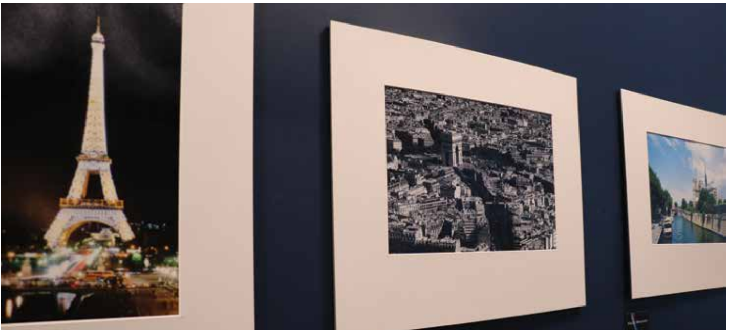
Vive La France – to set the mood at the venues for the DSU French Film Festival in February, photography and art students supplied photos and artwork which represented the country.